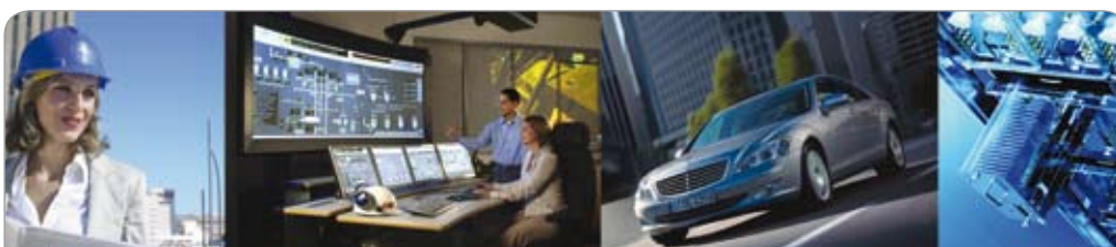
Some of the application areas within the D-MINT Project

Software-intensive systems are becoming more and more part of our lives in technical, financial and social domains. The requirements on the functionality of such systems are increasing, as are the demands on their quality and reliability. As a result of these increased requirements, the overall