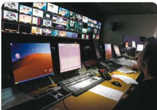
Multimedia users often need to retrieve rapidly critical clips of only a few seconds out of thousand of hours of material

In the multimedia case, the metadata can be associated with the elementary scenes; in the case of video surveillance, the indexing will be based on dynamic metadata that needs to be preserved in the cut-and-edit process of transferring content to the user.