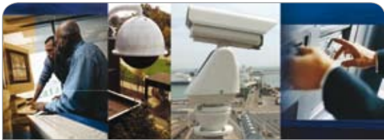
Video surveillance results in huge volumes of data that cannot be reduced by usual compression techniques

LINDO is leveraging existing technologies to develop a generic user-transparent architecture where indexation is distributed over multiple devices on which content is stored and archived. This will make it possible to index and retrieve specific objects reliably from very large amounts of acquired multimedia information without having to centralise content. Video surveillance – both fixed and mobile – and multimedia archives will be the first markets addressed with dedicated demonstrators.